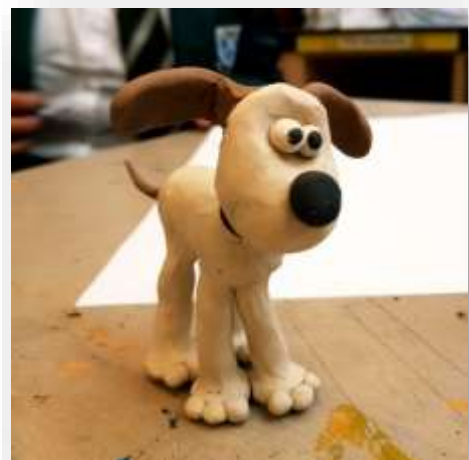
A Year 8 model of Gromit