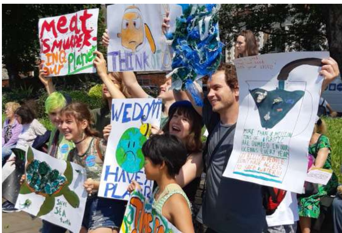
Groups of campaigners rallying together to share their support for this great cause.

It was reassuring to see people from all different backgrounds and all ages come along to support the cause raised by CAFOD. As custodians of our planet we need to recognise that there needs to be action now to address the reckless destruction of our earth. Our future generations will be the ones that inherit an earth that will not provide sustained growth.