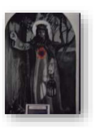
Joy to the World