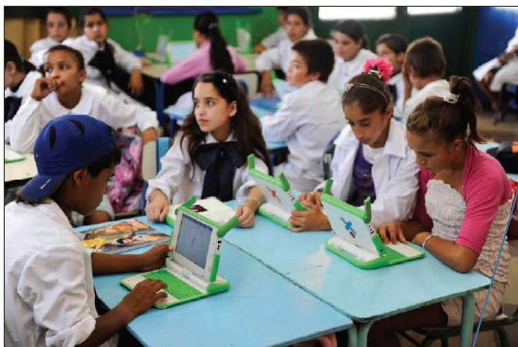
Figure 1.6 – Development aid, an education project in Uruguay, South America

'Long-term development aid is more effective than short-term emergency aid.'